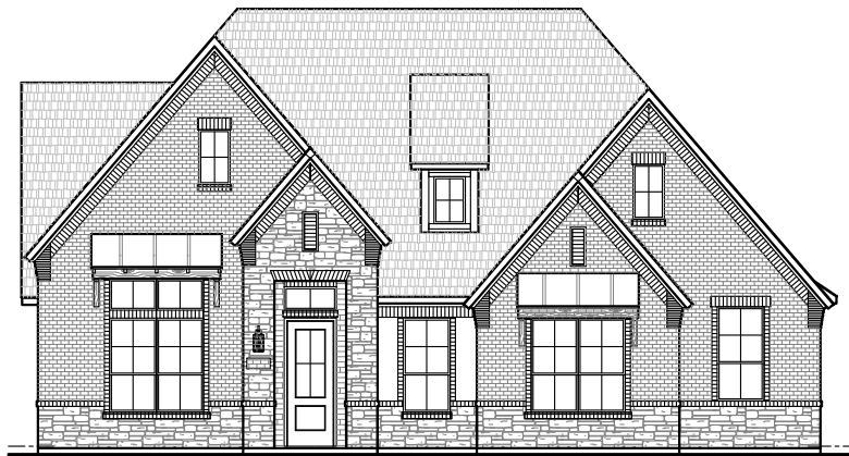
FRONT ELEVATION B STONE OPTION