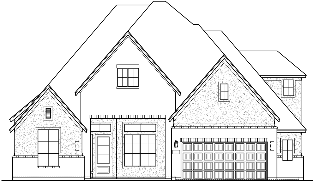
FRONT ELEVATION 'B1'

Plan 370255 | 3702 Square Footage | 5 Bedrooms | 4.5 Baths | 2-Car Garage