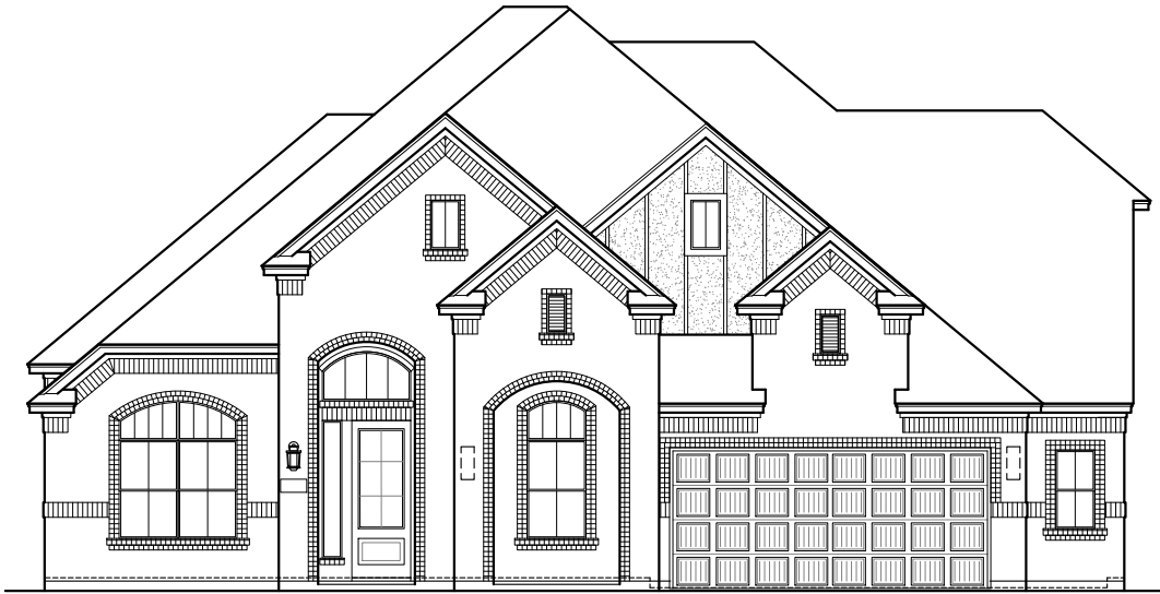
FRONT ELEVATION 'A1'

Plan 370255 | 3702 Square Footage | 5 Bedrooms | 4.5 Baths | 2-Car Garage