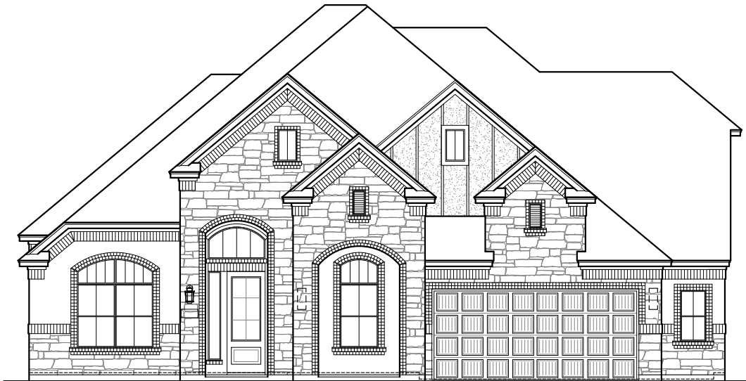
FRONT ELEVATION 'A1' STONE OPTION