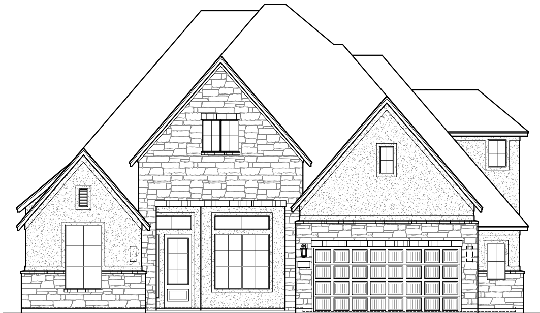
FRONT ELEVATION 'B1' STONE OPTION