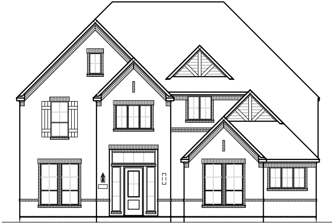
FRONT ELEVATION 'A1'

Plan 401150 | 4011 Square Footage | 4 Bedrooms | 3 Baths | 2-Car Garage