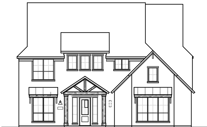
FRONT ELEVATION 'C1'