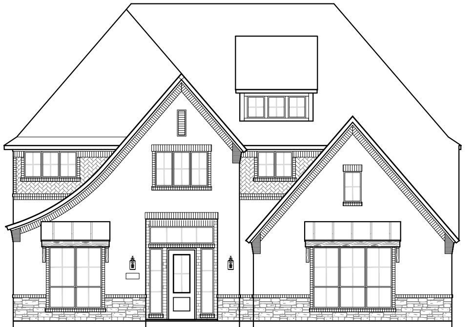
FRONT ELEVATION 'B1' STONE OPTION