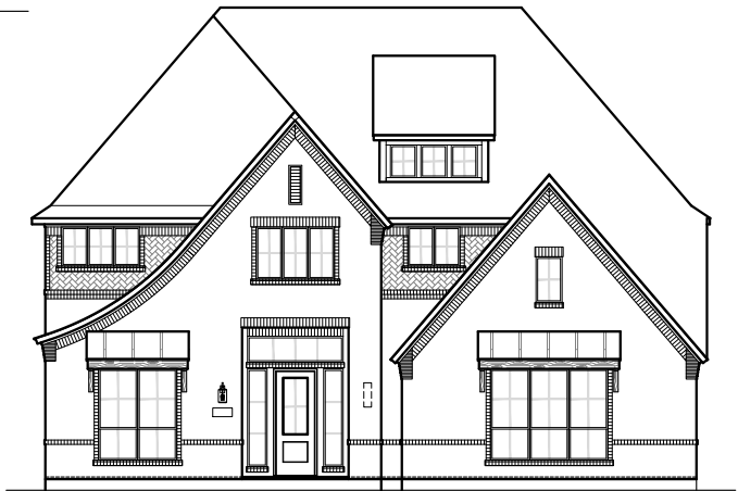
FRONT ELEVATION 'B1'