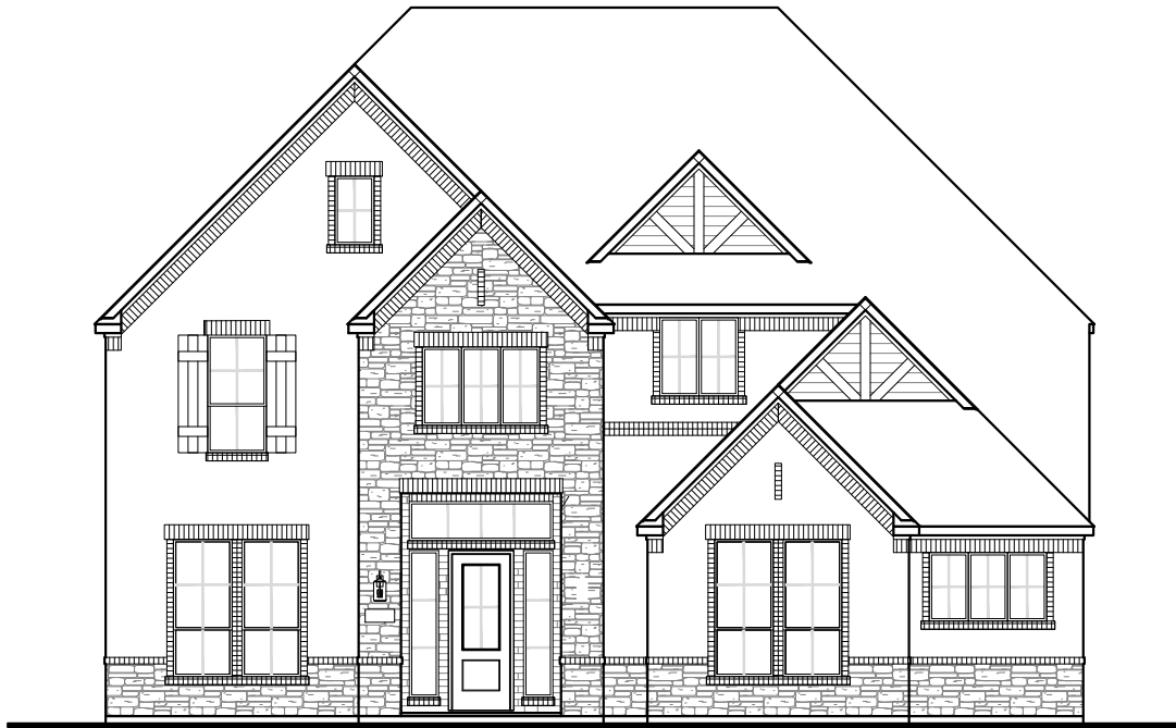
FRONT ELEVATION 'A1' STONE OPTION

Plan 401150 | 4011 Square Footage | 4 Bedrooms | 3 Baths | 2-Car Garage