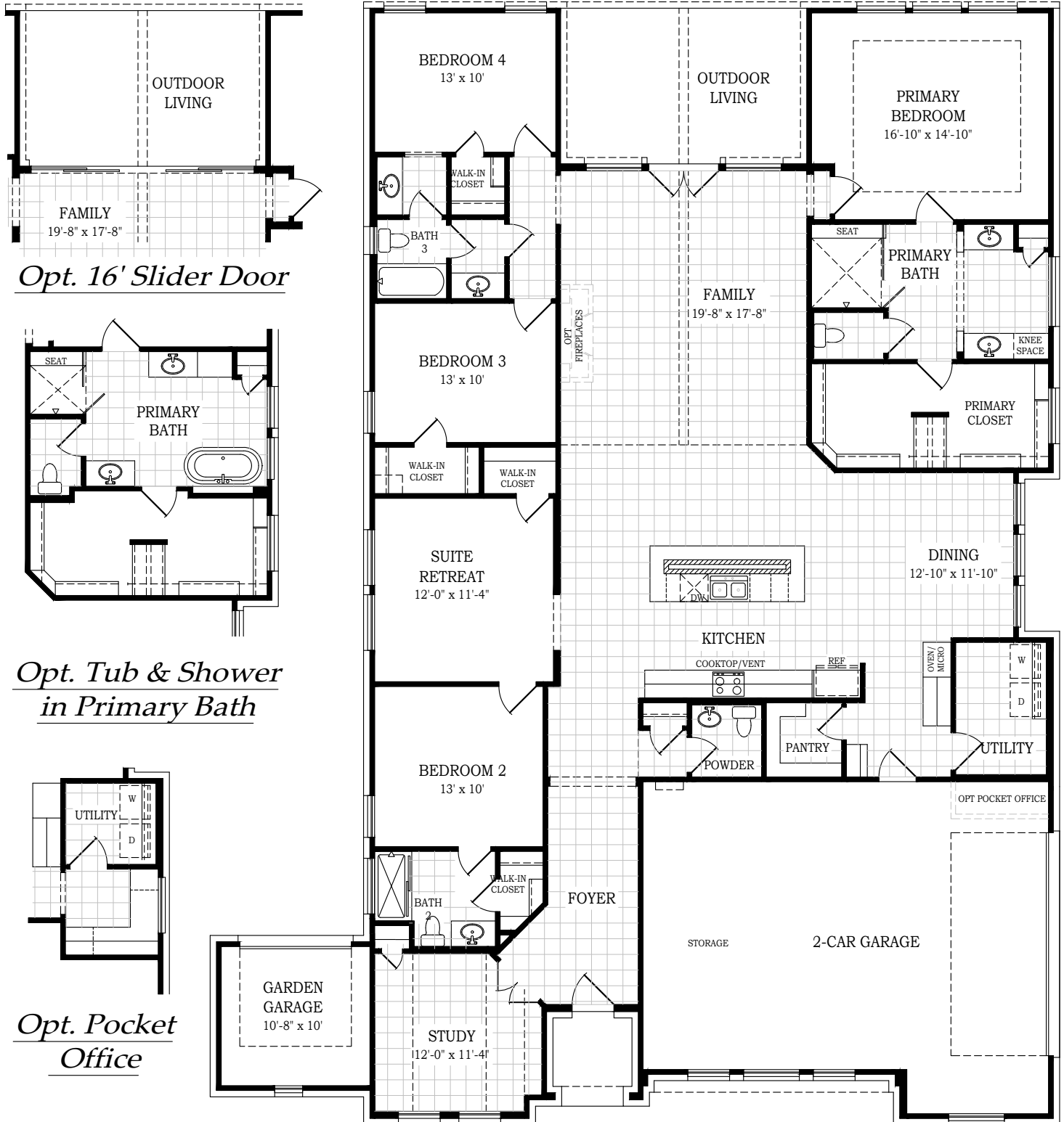
Opt. 16' Slider Door

Plan 2982 | 2,982 Conditioned sq. ft. | 4 Bedrooms | 3.5 Baths | 2-Car w/ Storage