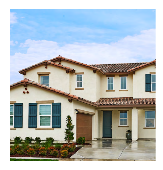
Ask your Richmond American sales associate about the energy-efficient home features available in your area!

Building a new home can give you the freedom to choose your own colors and finishes, whereas buying a resale home means you'll have to settle for someone else's style choices. Though you can always redecorate later, changing items like orange carpeting and dated cabinetry can be expensive—and they're often put off for a rainy day that never seems to come.