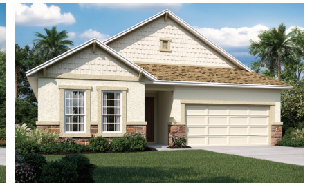
Elevation C - shown with opt. stone