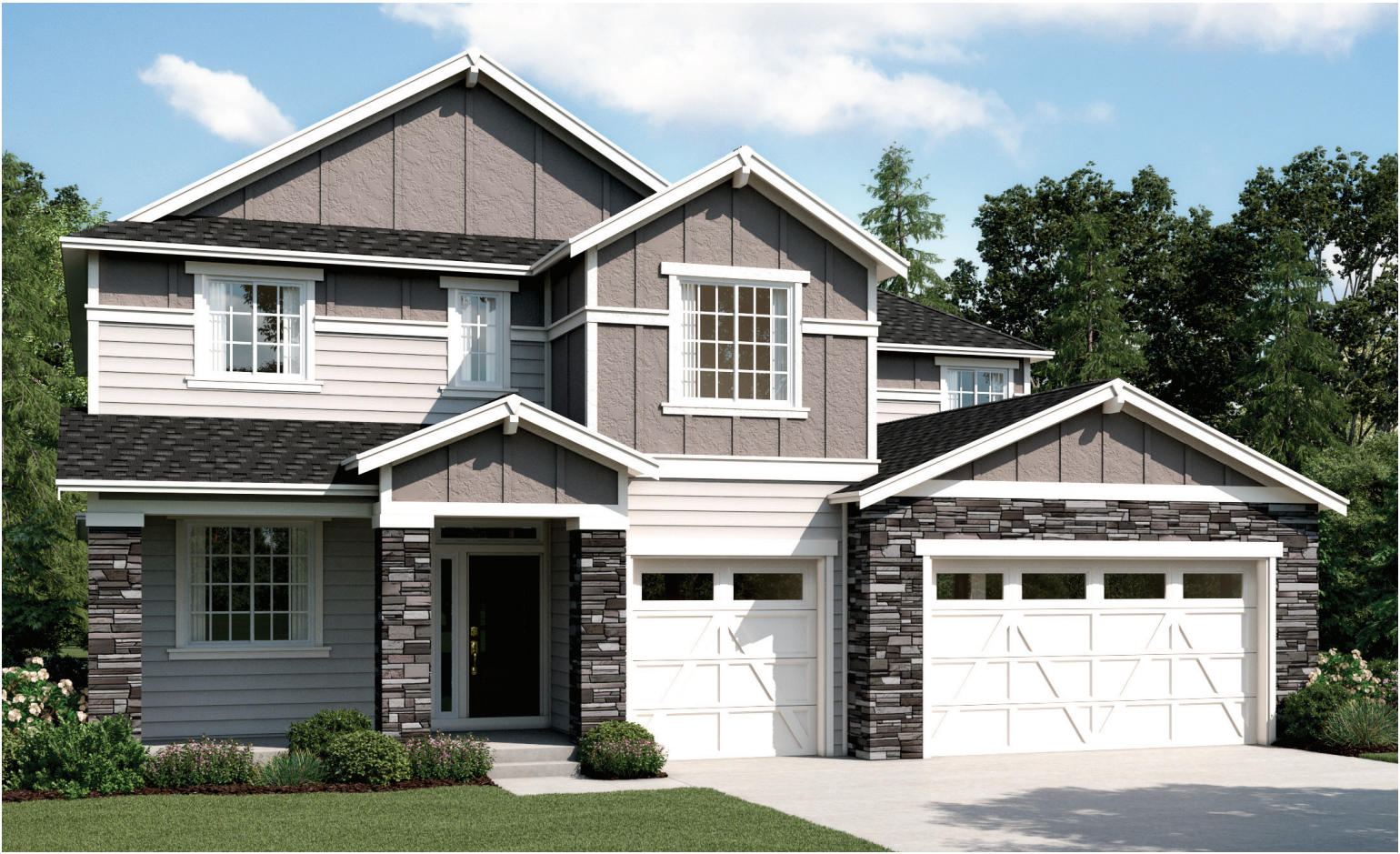
ELEVATION E - 3-CAR GARAGE