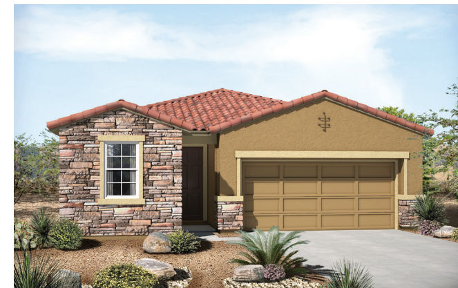
Elevation C shown with optional stone