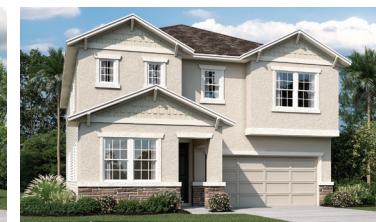
ELEVATION C - SHOWN W/ OPT. STONE