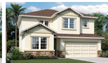
ELEVATION C - SHOWN W/ OPT. STONE