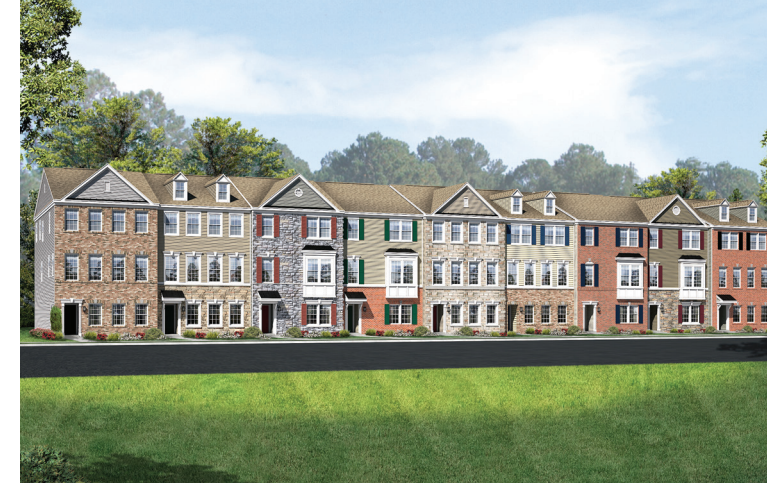
Elevation G / B / J / A / F / C / E / D / H

Approx. square feet: 2,650 Stories: 3 Bedrooms: 3 - 4 Garage: 2-car Plan Number: V621