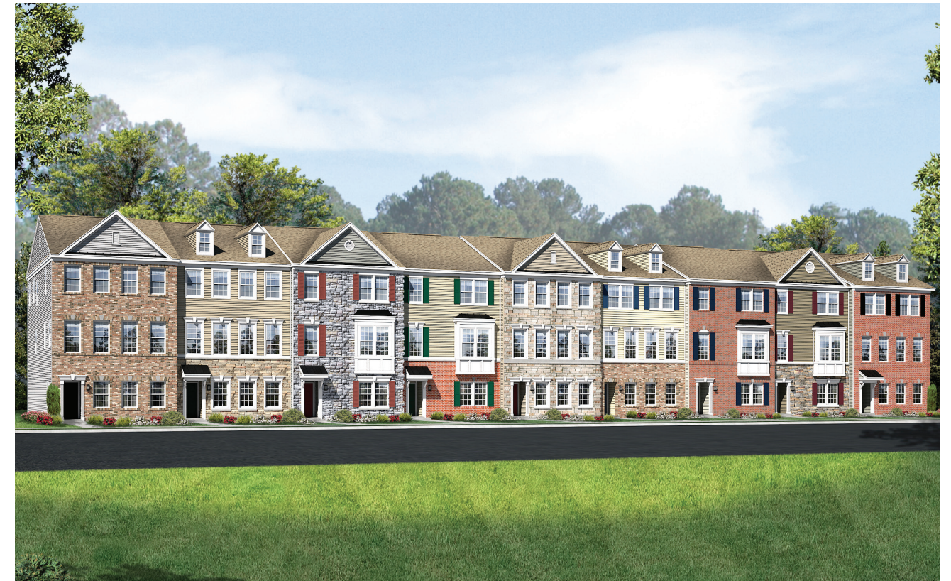
Elevation G / B / J / A / F / C / E / D / H

A 2-car alley-entry garage and recreation room are featured on the entry level of this home. Upstairs, a spacious great room and a kitchen with a separate dining area create a space where your family can grow. Enjoy an inviting retreat in the sprawling master bedroom, boasting a luxurious walk-in shower.