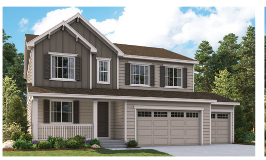
ELEVATION B ELEVATION A

Floor plans and renderings are conceptual drawings and may vary from actual plans and homes as built. Options and features may not be available on all homes and are subject to change without notice. Actual homes may vary from photos and/or drawings which show upgraded landscaping and may not represent the lowest-priced homes in the community. Features may include optional upgrades and may not be available on all homes. Prices, specifications and availability are subject to change without notice. Square footage is approximate and subject to change without notice. ©2023 Richmond American Homes, Richmond American Homes of Colorado, Inc. 12/28/2023