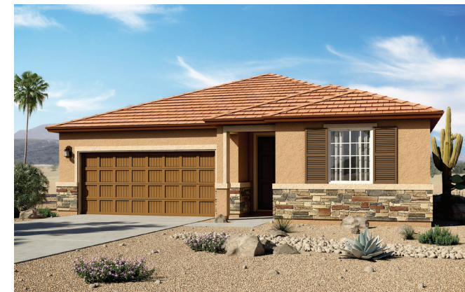
Elevation C Shown with optional stone