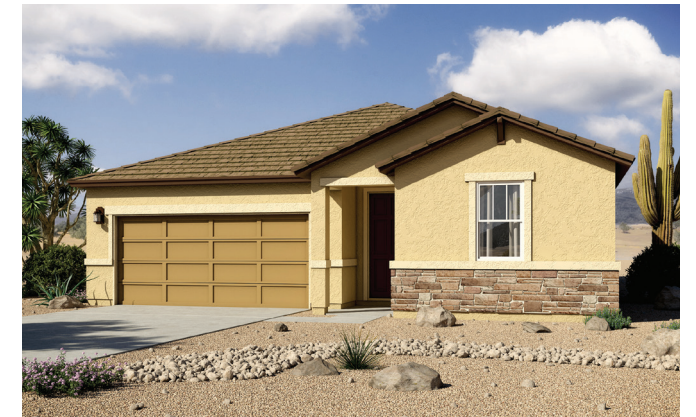
Elevation B Shown with optional stone