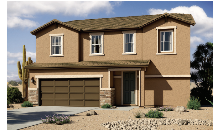
Elevation B Shown with optional stone