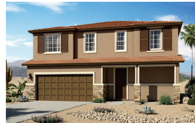
Elevation C Shown with optional stone