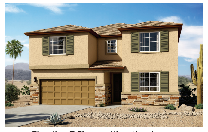
Elevation C Shown with optional stone