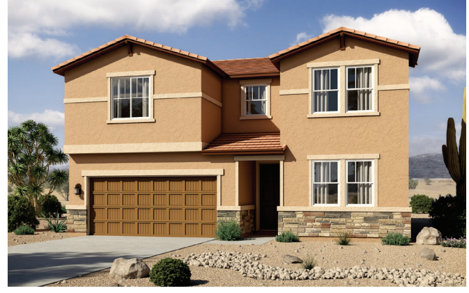
Elevation B Shown with optional stone