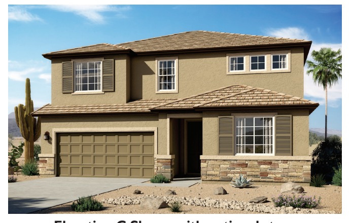
Elevation C Shown with optional stone