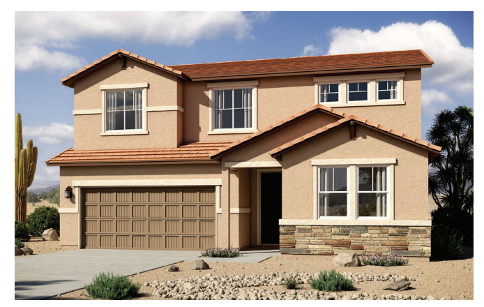
Elevation B Shown with optional stone

Love to entertain? The Hopewell's wide open great room and dining area are ideal for gathering with friends and family. The adjacent kitchen allows you to interact with guests without interrupting meal prep. An optional sunroom provides even more space to mingle. Upstairs, enjoy a loft, two guest rooms and a large master bedroom with a private bath and immense walk-in closet. Personalize with a pocket office, additional bedrooms, a deluxe master bath and more.