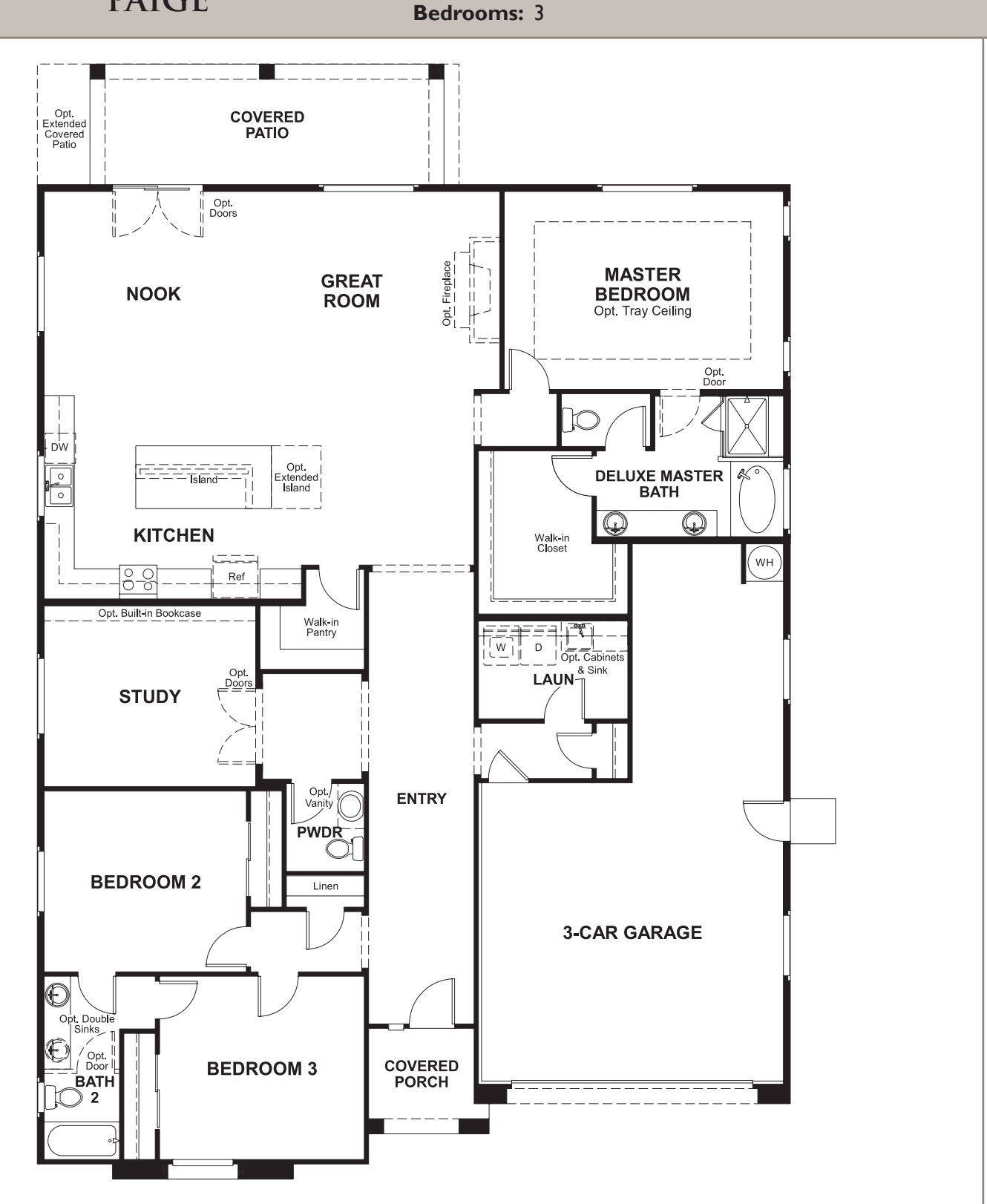
Floor Plan Main Floor

THIS PLAN'S PROJECTED HERS® INDEX = 0 Projected Rating Based on Plans – Field Confirmation Required