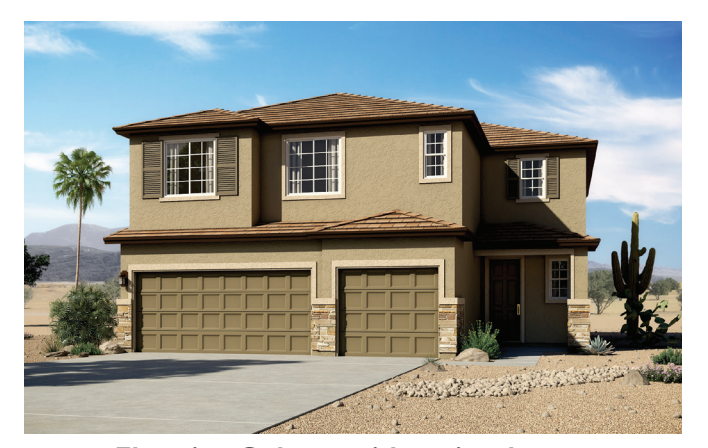
Elevation C shown with optional stone