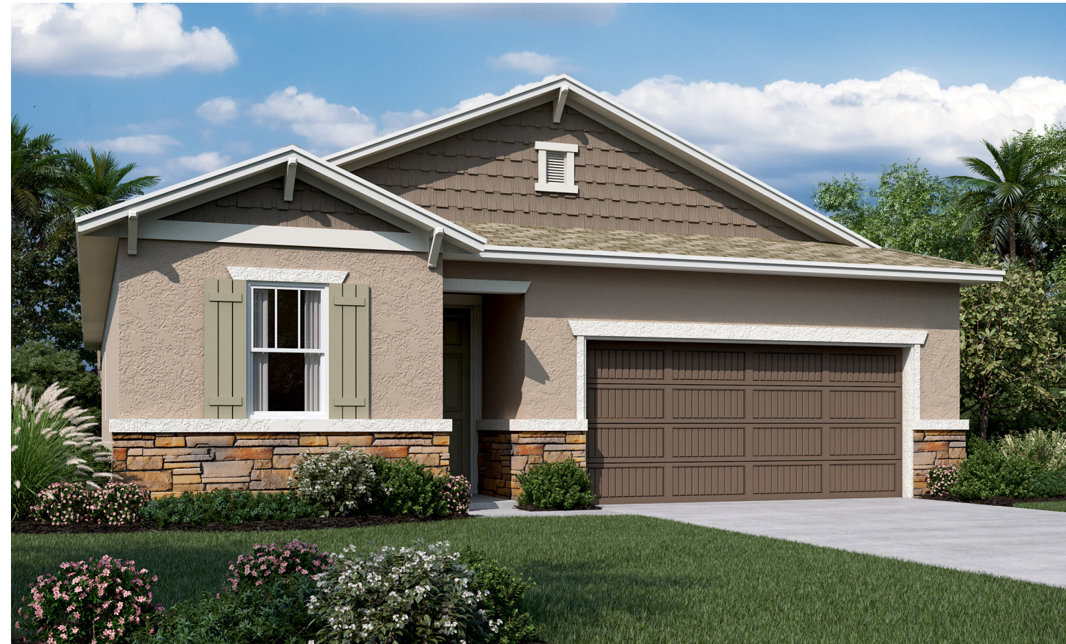
ELEVATION C - SHOWN W/ OPT. STONE

Approx. 1,900sq. ft. | 1 story | 4 bedrooms | 2-car garage | Plan #FC11