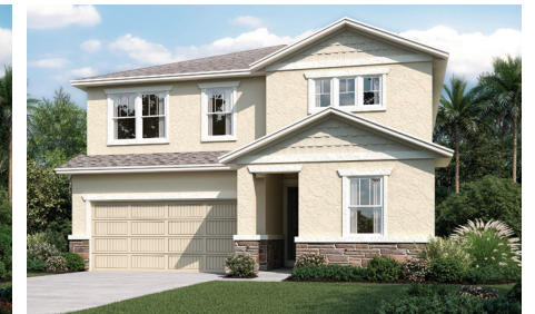
Elevation C - Shown with Opt. Stone