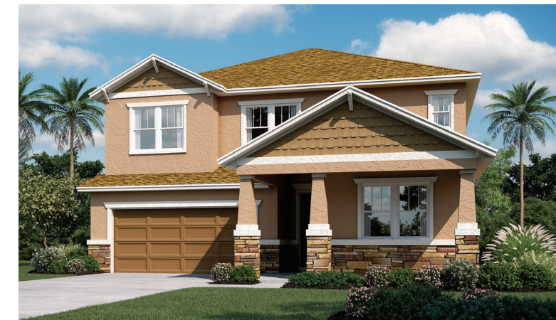
ELEVATION C - SHOWN W/ OPTIONAL STONE