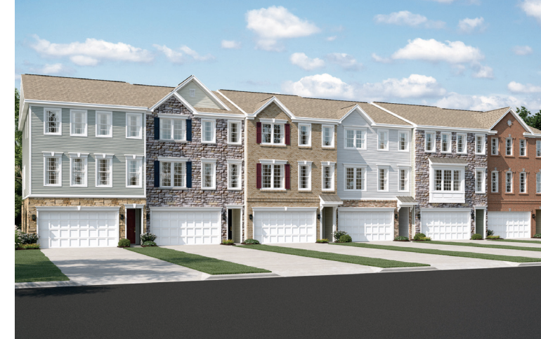
Elevation A / C / D / B / E / F

Approx. square feet: 2,850 Stories: 3 Bedrooms: 3 - 4 Garage: 2-car Plan Number: M737