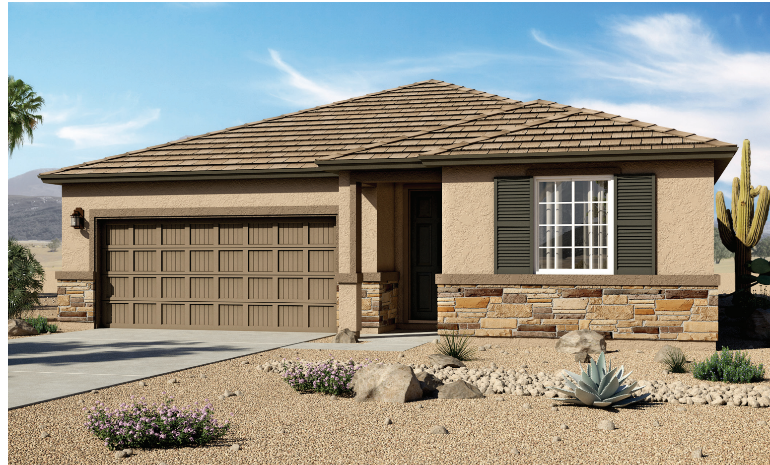
ELEVATION C - SHOWN WITH OPT. STONE