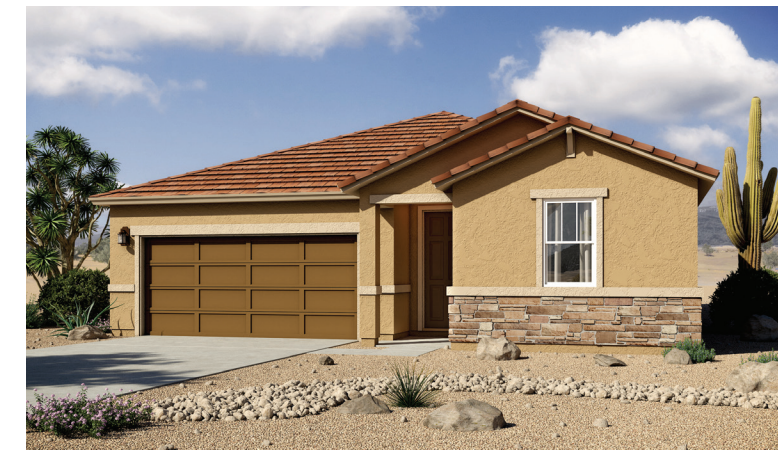
ELEVATION B - SHOWN WITH OPT. STONE