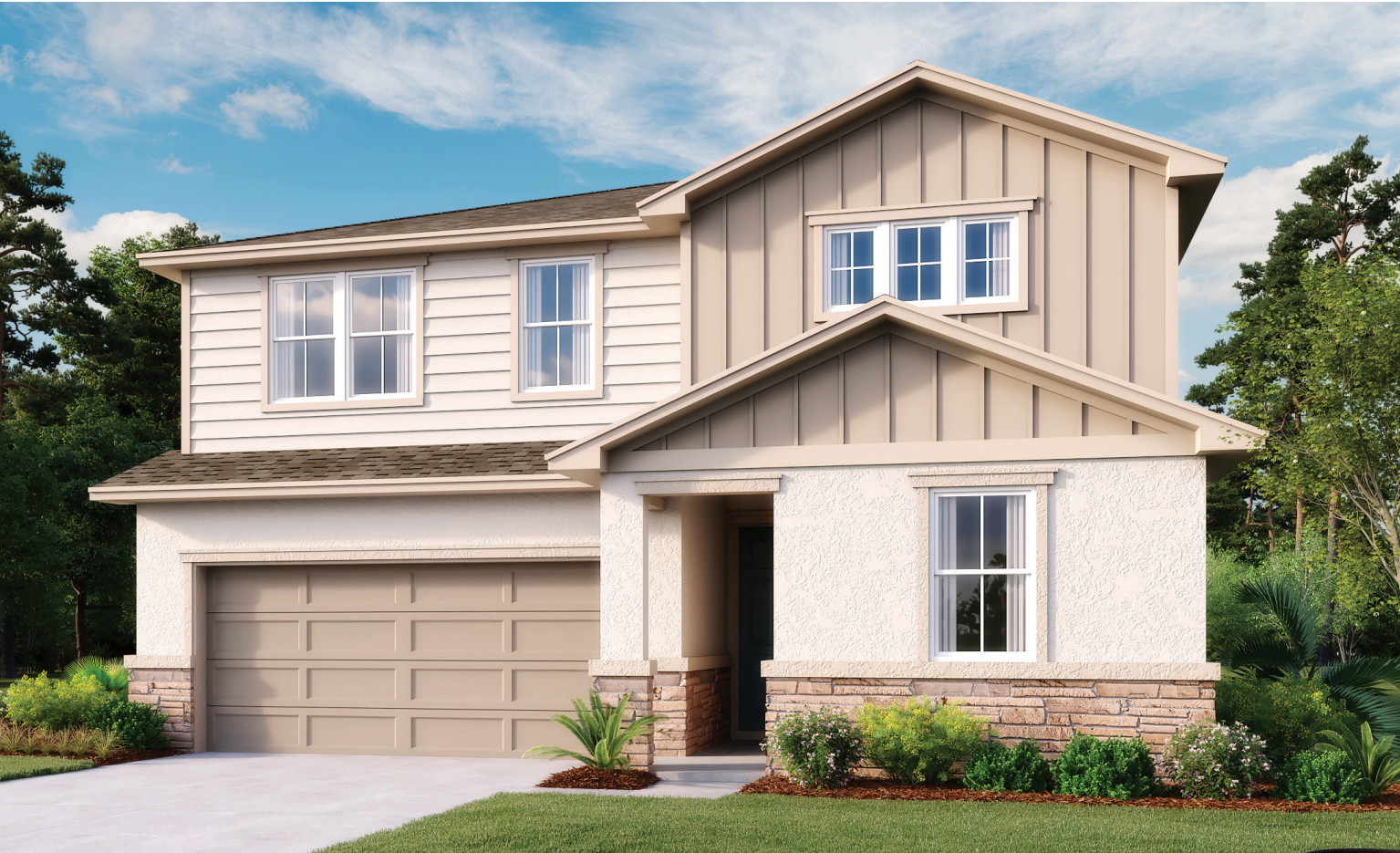
ELEVATION F - SHOWN W/ OPT STONE

Approx. 2,500 sq. ft. | 2 stories | 3-5 bedrooms | 2- to 3-car garage | Plan #F913