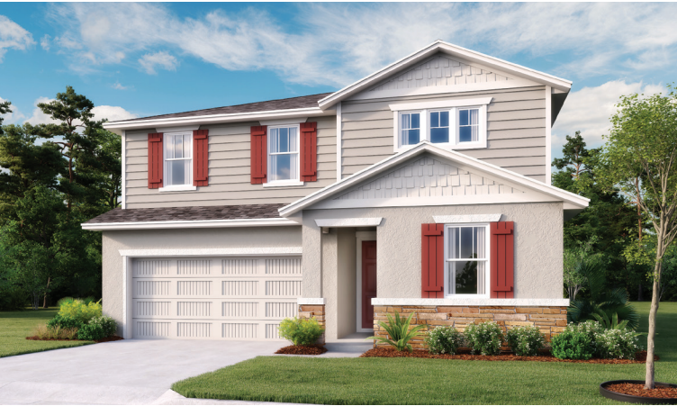
ELEVATION E - SHOWN W/ OPTIONAL STONE