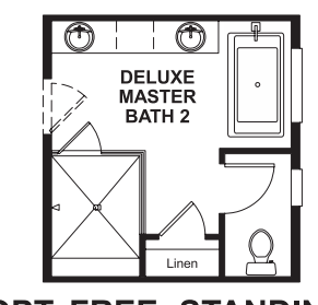
OPT. FREE- STANDING TUB AT DELUXE MASTER BATH 2

Floor plans and renderings are conceptual drawings and may vary from actual plans and homes as built. Options and features may not be available on all homes and are subject to change without notice. Actual homes may vary from photos and/or drawings which show upgraded landscaping and may not represent the lowest-priced homes in the community. Features may include optional upgrades and may not be available on all homes. Square footage numbers are approximate and are subject to change without notice. Prices, specifications and availability subject to change without notice. @2019 Richmond American Homes, Richmond American Homes of Colorado, Inc. 7/2/2019