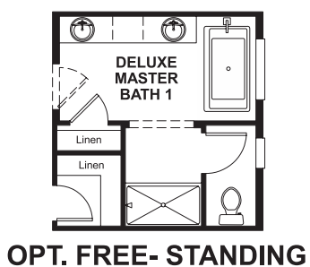
TUB AT DELUXE MASTER BATH 1