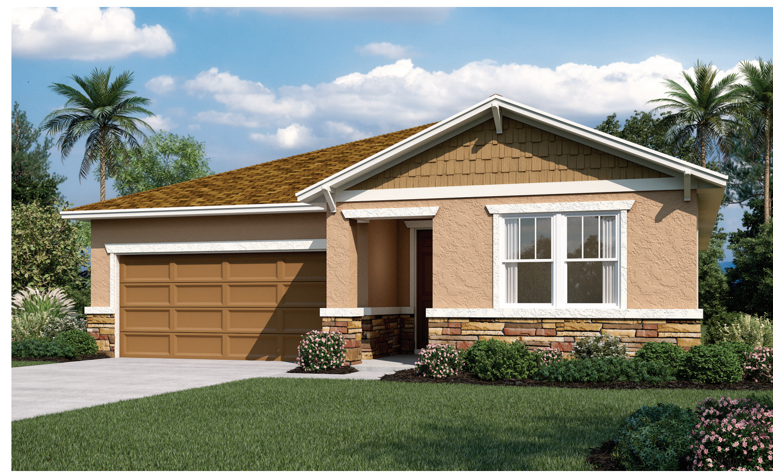
ELEVATION C - SHOWN W/ OPT. STONE

Approx. 1,600sq. ft. | 1 story | 3 bedrooms | 2-car garage | Plan #F9C2