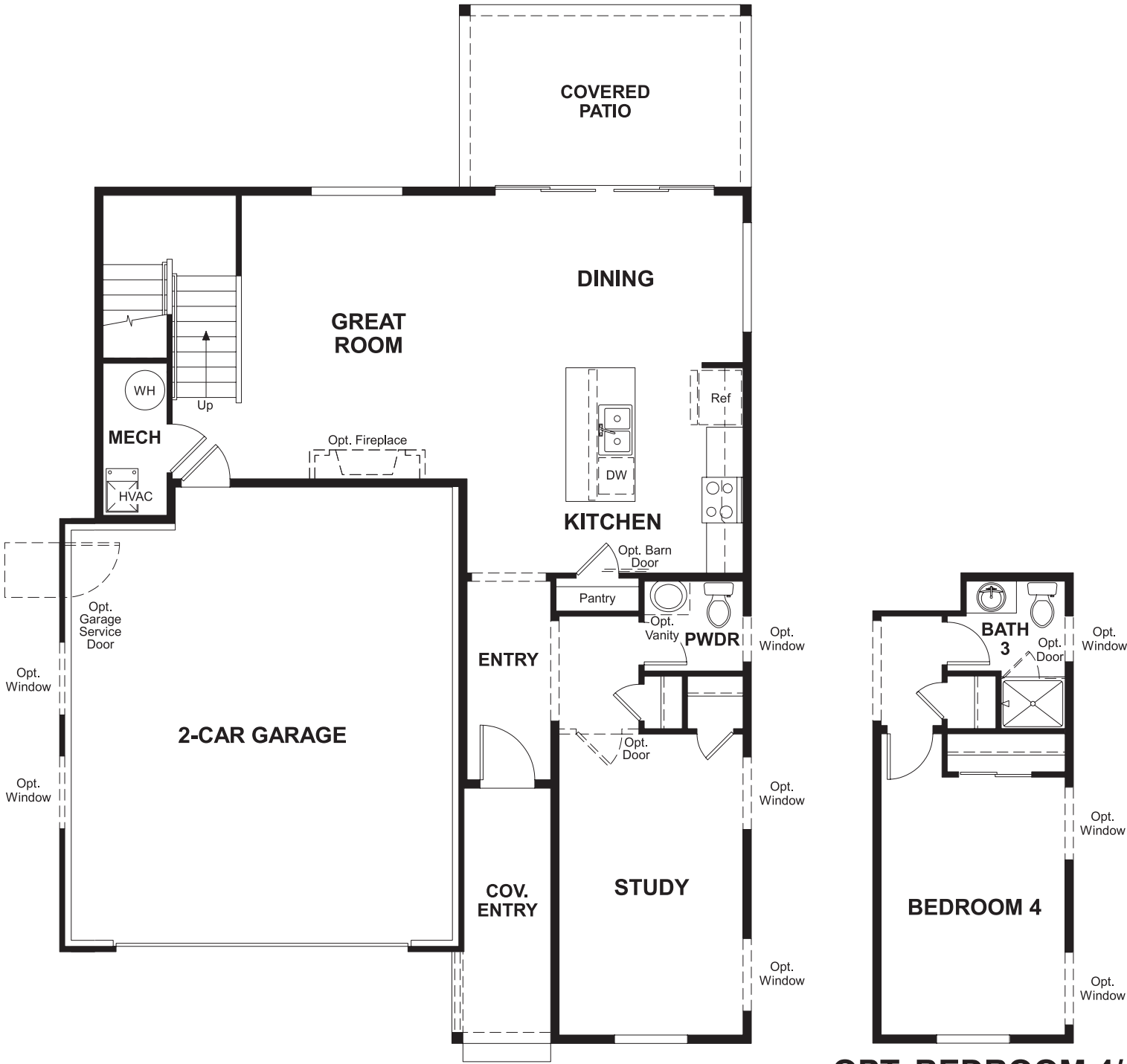
OPT. BEDROOM 4/ BATH 3