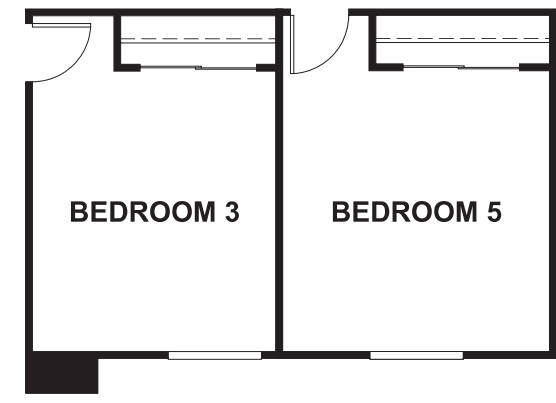
OPT. BED 5

THIS PLAN'S PROJECTED HERS® INDEX = 27* Projected Rating Based on Plans – Field Confirmation required