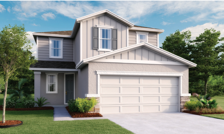
ELEVATION B - SHOWN WITH OPT. STONE