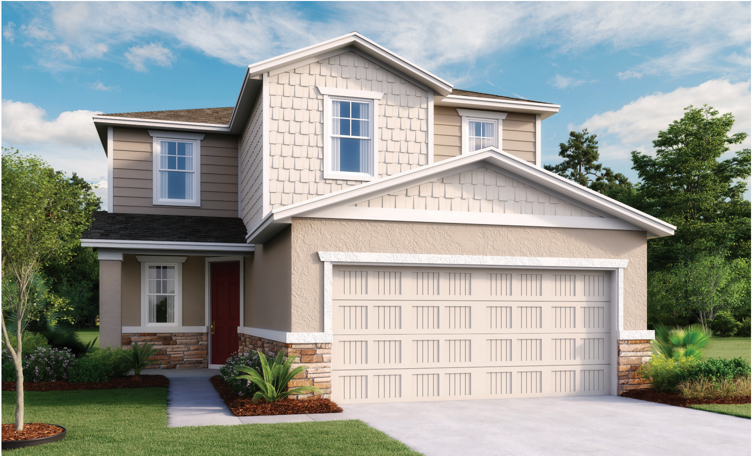
ELEVATION C - SHOWN WITH OPT. STONE

Approx. 2,350 sq. ft. | 2 stories | 4-6 bedrooms | 2-car garage | Plan #F937