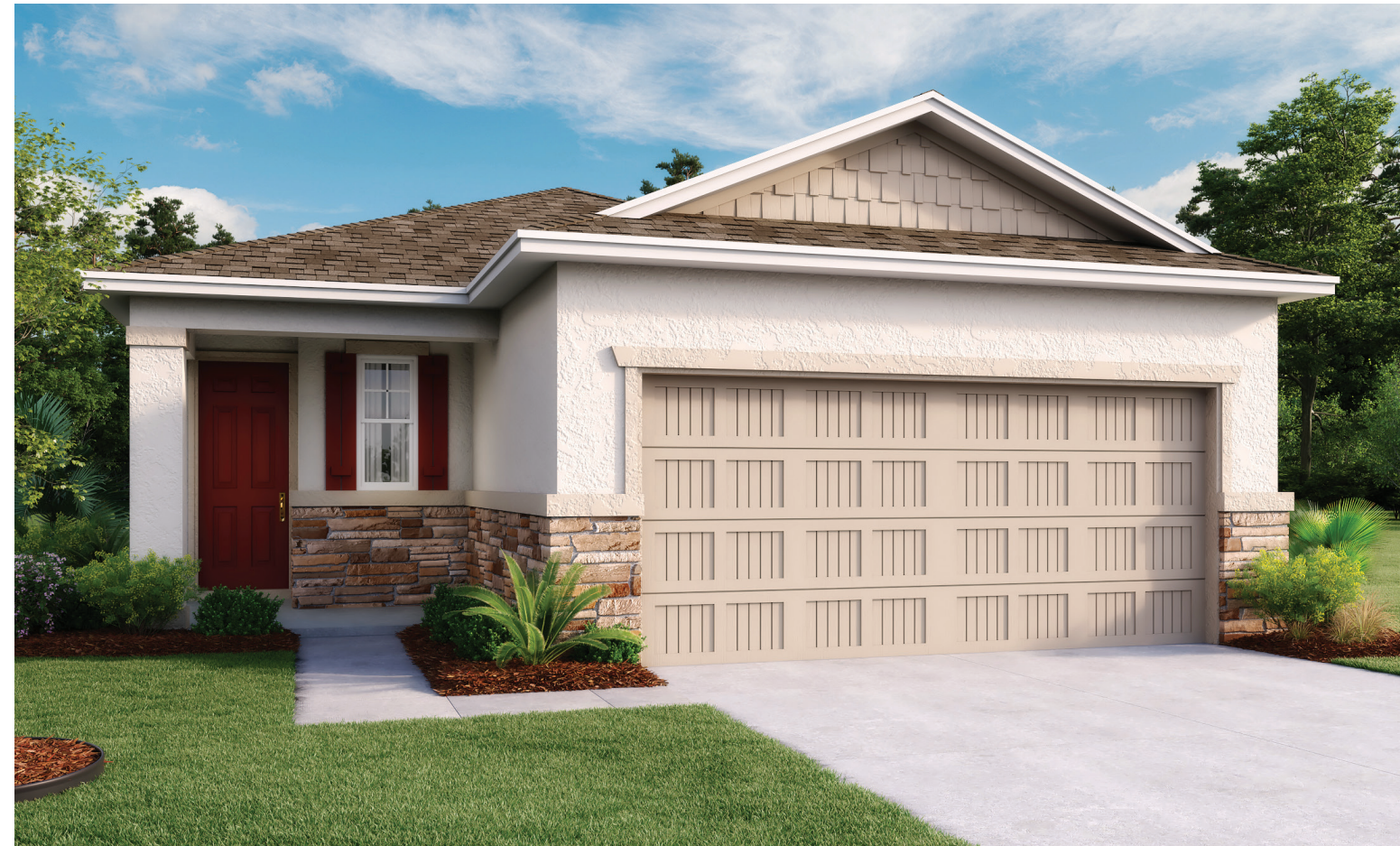
ELEVATION C - SHOWN WITH OPT. STONE

Approx. 1,570 sq. ft. | 1 story | 3 bedrooms | 2-car garage | Plan #F933