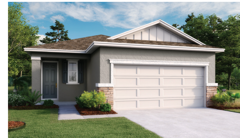
ELEVATION B - SHOWN WITH OPT. STONE