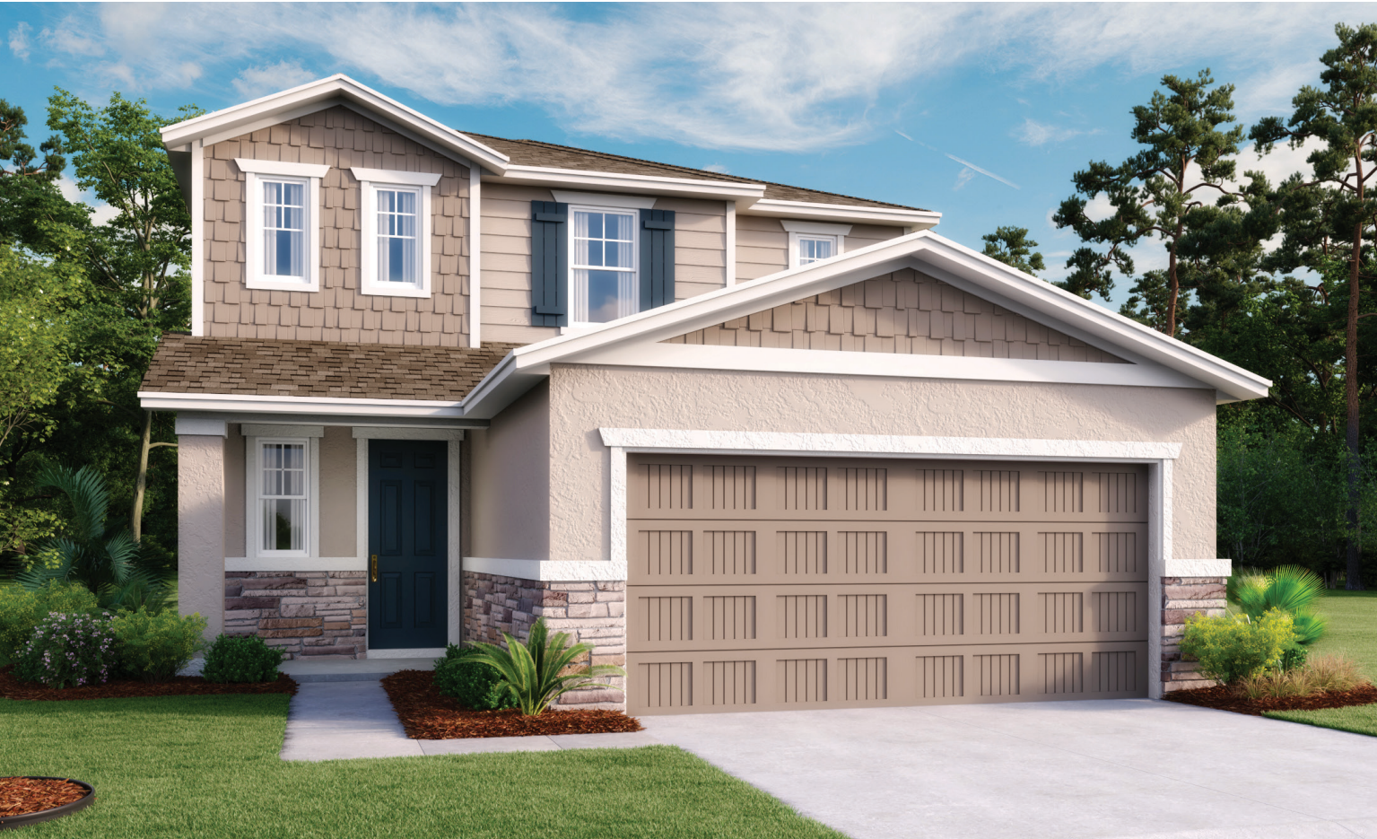
ELEVATION C - SHOWN WITH OPT. STONE

Approx. 1,860 sq. ft. | 1 story | 2-4 bedrooms | 2-car garage | Plan #F935