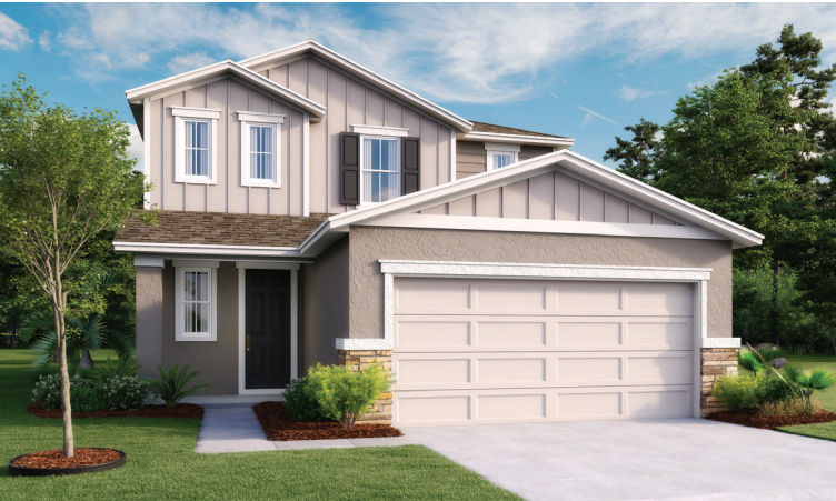
ELEVATION B - SHOWN WITH OPT. STONE