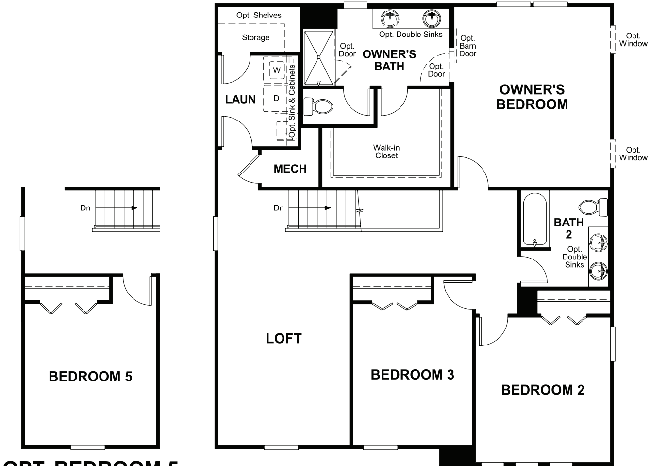
OPT. BEDROOM 5

THIS PLAN'S PROJECTED HERS® INDEX = 61 *