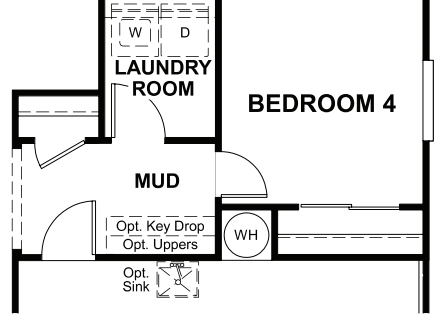
OPT. BEDROOM 4 & 2 OR 3-CAR GARAGE

Floor plans and renderings are conceptual drawings and may vary from actual plans and homes as built. Options and features may not be available on all homes and are subject to change without notice. Actual homes may vary from photos and/or drawings which show upgraded landscaping and may not represent the lowest-priced homes in the community. Features may include optional upgrades and may not be available on all homes. Square footage numbers are approximate and are subject to change without notice. Prices, specifications and availability subject to change without notice. ©2020 Richmond American Homes, Richmond American Homes of Arizona, Inc. (a public report is available on the state real estate department's website), Richmond American Construction, Inc. ROC #206612. 12/29/2020