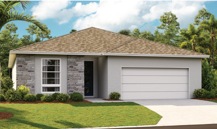
ELEVATION L - SHOWN W/ OPTIONAL STONE

Orlando Home Gallery™ | 2822 Commerce Park Drive, Suite 100 | Orlando, FL 32819 | 407.450.7320