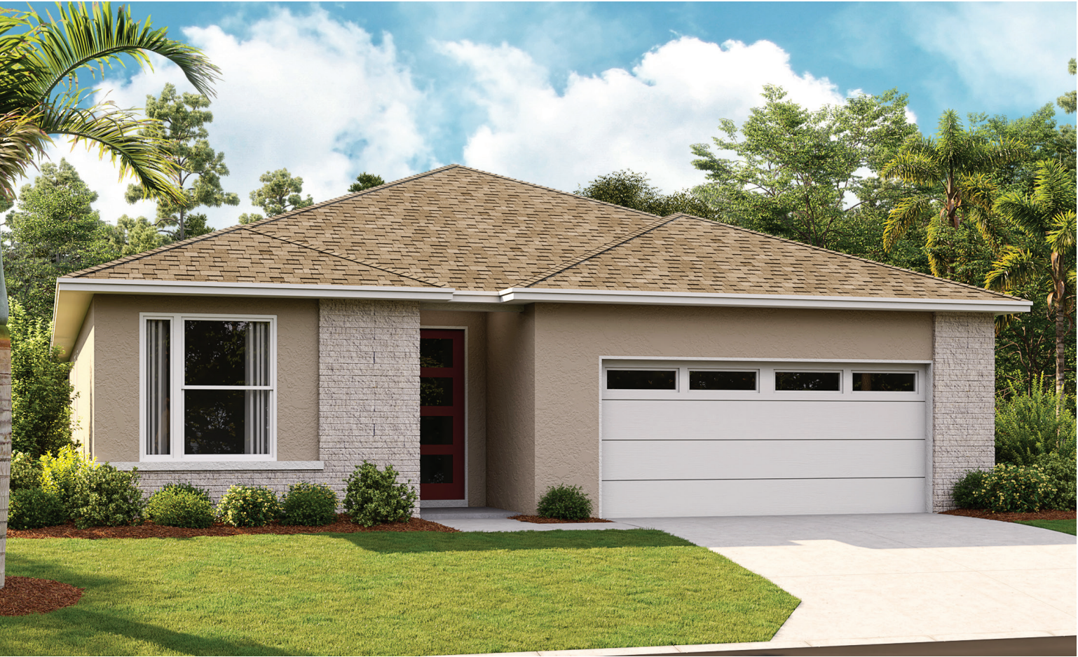
ELEVATION M - SHOWN W/ OPTIONAL STONE

Approx. 2,070 sq. ft. | 1 story | 4 bedrooms | 2-car garage | Plan #F927