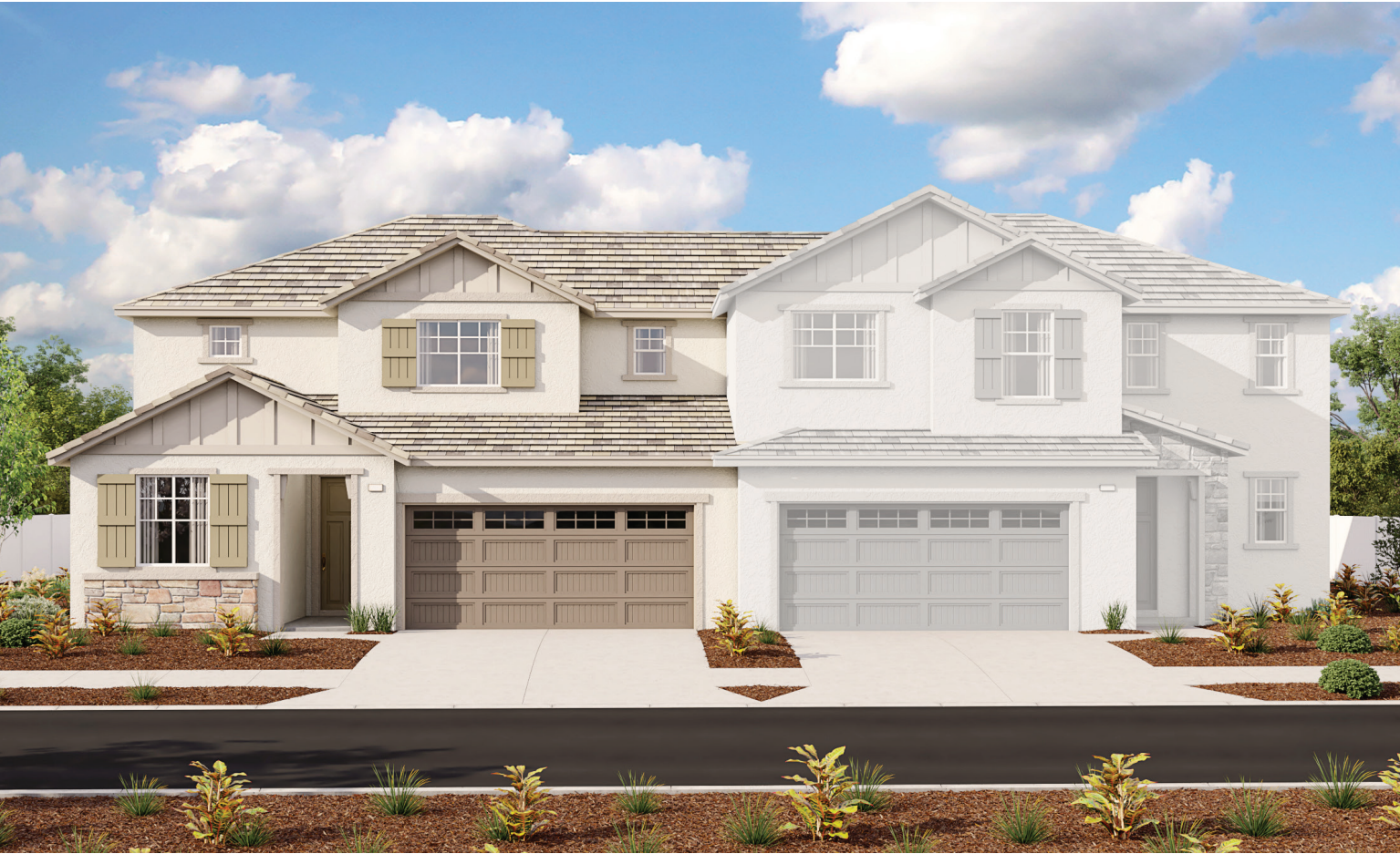
ELEVATION C - Shown with Coral Duo

Imagine your life in the two-story Citrine Duo plan. Breakfast at the spacious kitchen island or in the nearby dining nook. Host a movie night in the inviting great room. At the end of the day, retreat upstairs to the primary suite, complete with a roomy walk-in closet and private bath. The second floor also boasts two additional bedrooms, a convenient laundry and another full bath. This home will be built with either a study or a fourth bedroom. You'll love the professionally curated finishes selected by our design team!