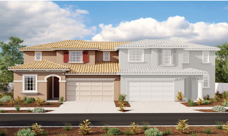
ELEVATION B - Shown with Coral Duo