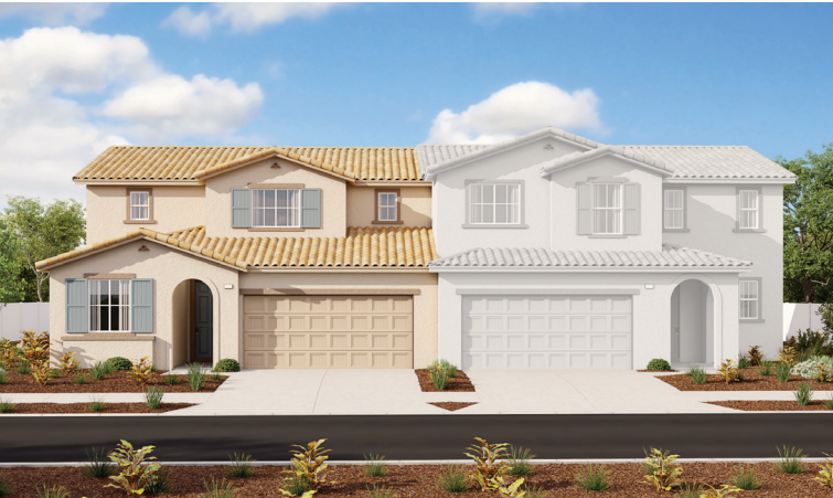
ELEVATION A - Shown with Coral Duo