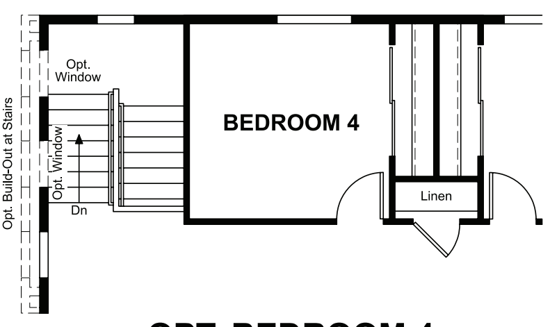
OPT. BEDROOM 4