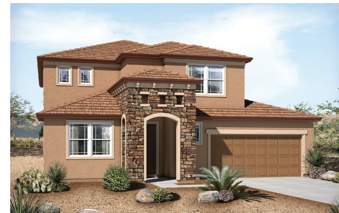
Elevation C - Shown with optional stone