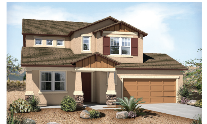
Elevation B - Shown with optional stone