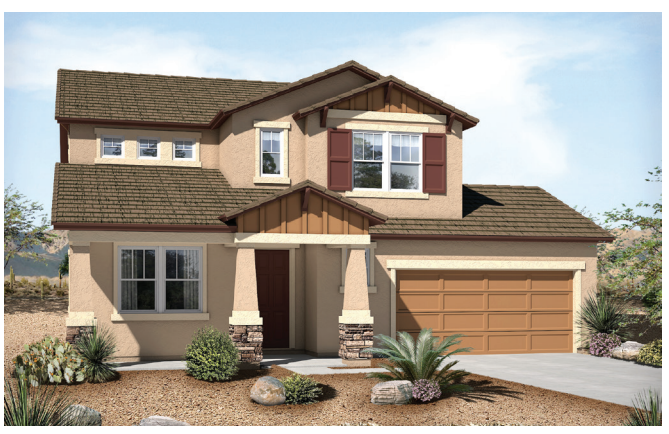
Elevation B - Shown with optional stone

The main floor of the Candace plan offers a quiet study, a formal dining room and an inviting great room that opens to a kitchen with a central island, breakfast nook and optional gourmet features. Upstairs, you'll find three large bedrooms, including a relaxing master suite with optional deluxe bath, a roomy loft and laundry.