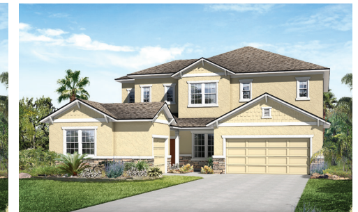
Elevation C - shown with opt. stone