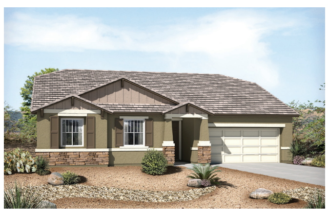
Elevation B - Shown with optional stone

The Daniel is a charming ranch home with thoughtful design details. The great room is open to the kitchen, which includes a convenient walk-in pantry and center island. The spacious master bedroom features a generous walk-in closet and a deluxe bath. Options include a gourmet kitchen and a built-in bookcase and French doors in the study.