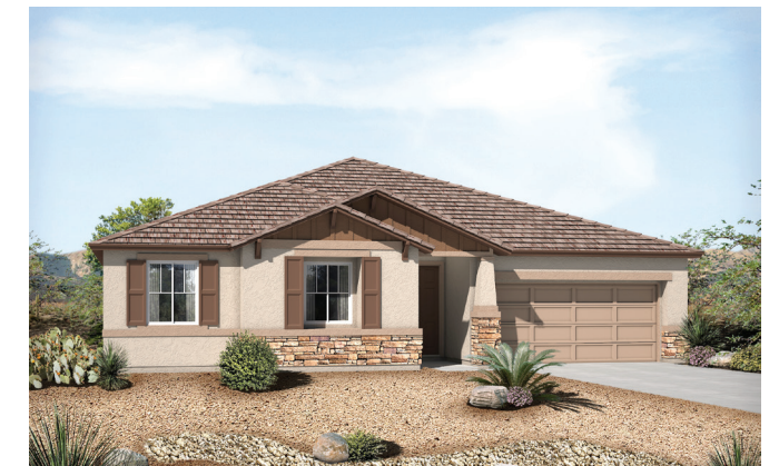
Elevation B - Shown with optional stone