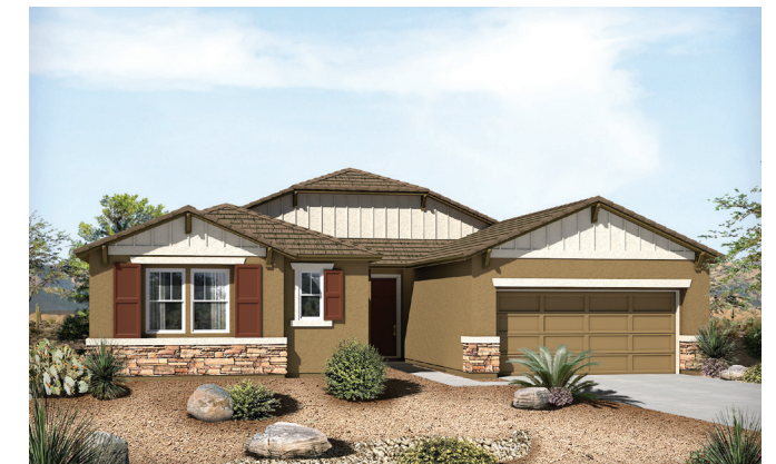
Elevation B - Shown with optional stone