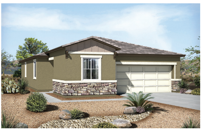
Elevation B - Shown with optional stone

The ranch-style Ford plan has been cleverly designed to separate entertaining spaces from living quarters. On one side, you'll find a private study just off the entry, formal dining room, a spacious kitchen and an open great room. On the other, a luxurious master suite and inviting bedrooms.