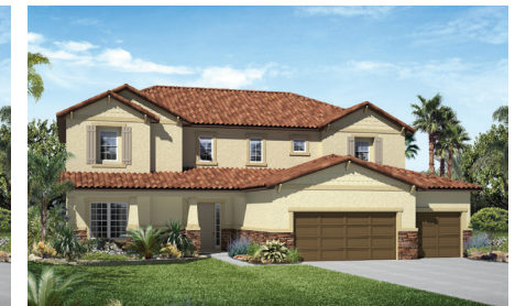
Elevation C - Shown w/Opt stone