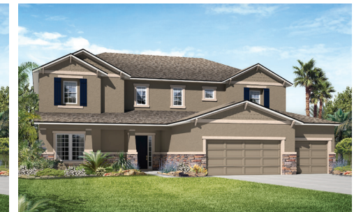
Elevation C - shown with optional stone