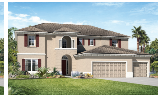
Elevation F - shown with optional stone