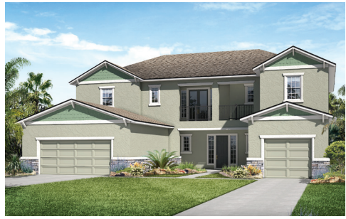
Elevation C - shown with optional stone