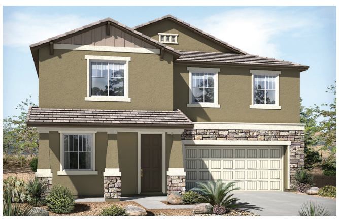
Elevation B - Shown with optional stone

A walk-in closet in every bedroom, a convenient upstairs laundry and a spacious family room that opens onto the kitchen, dining room and nook are just a few of the thoughtful details included in the Sadie floor plan. Add a study or main-floor bedroom in lieu of the formal living room, a gourmet kitchen and more.